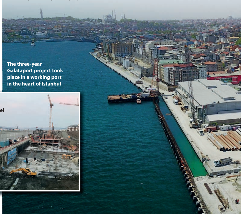
The three-year Galataport project took place in a working port in the heart of Istanbul

The process demanded significant deep soil mixing, with a thickness of 1500mm and a total volume of 250,000m 3 of treated soil.