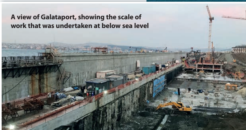
A view of Galataport, showing the scale of work that was undertaken at below sea level