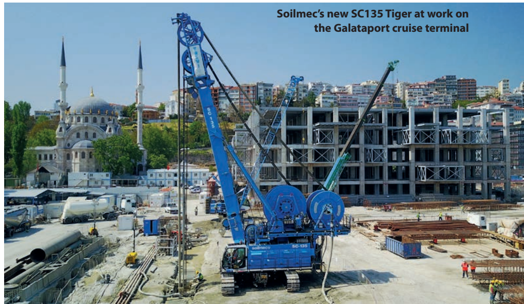
Soilmec's new SC135 Tiger at work on the Galataport cruise terminal

At Karaköy, where historic buildings were to be preserved, Trevi had to construct 13m diaphragm walls around two such buildings, where basements were to be constructed.